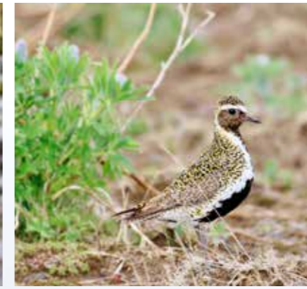
Spot the Lóa and listen for its beautiful song