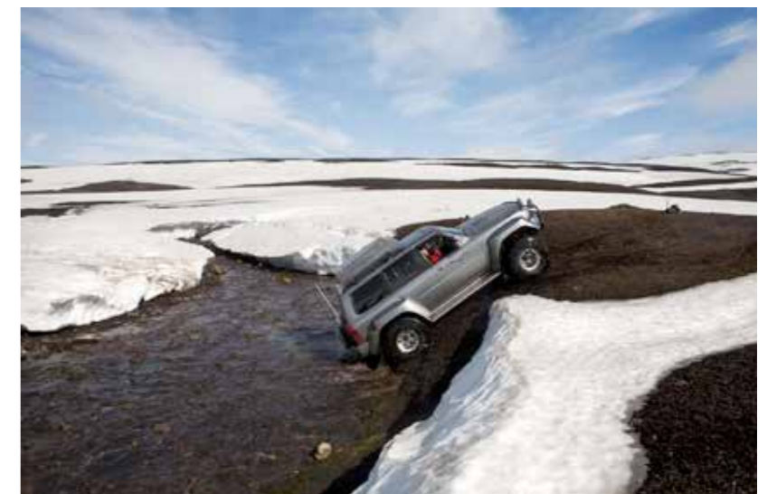
Explore Iceland's highs and lows