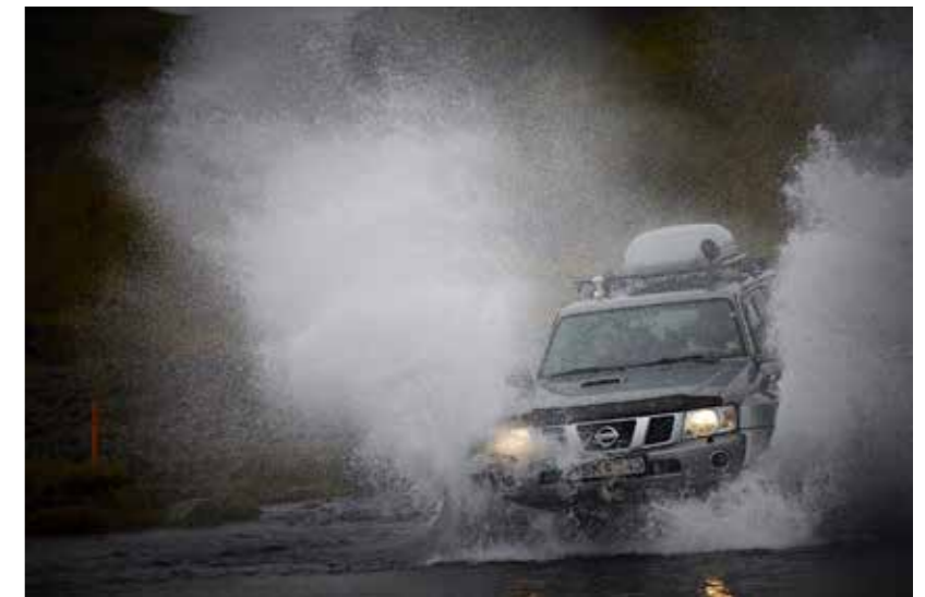
Super Jeeps tackle even the roughest terrain

foss waterfall. Or why not book a tour of the wide open countryside and immerse yourself in the beauty of the Farmland, Lava Meadows, Volcanoes, Waterfalls and Glaciers. If you prefer a more active Super Jeep experience, then why not combine this with a Snowmobile ride or a trip to the Geo Thermal hot springs. For nature lovers, a route can be designed to take in the South Coast where you enjoy the varied birdlife and exceptional basalt rock formations near the town of Vik. Whatever your preference, a Super Jeep tour offers the most exhilarating and enjoyable way to explore the natural Icelandic environment. Half Day, Full Day and overnight excursions can be arranged on request.