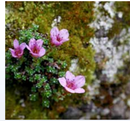
The Winter Flower ( Saxifraga oppositifolia )