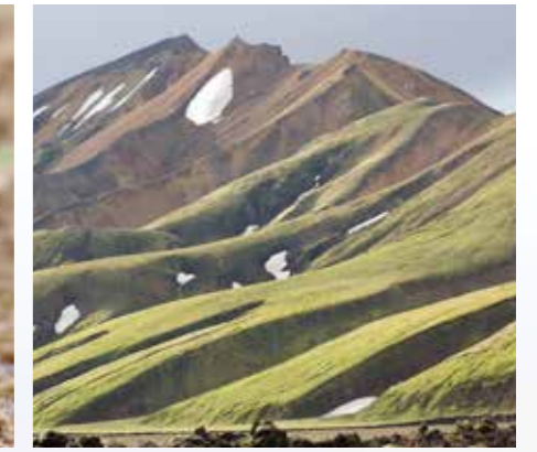
Enjoy the spectacular scenery